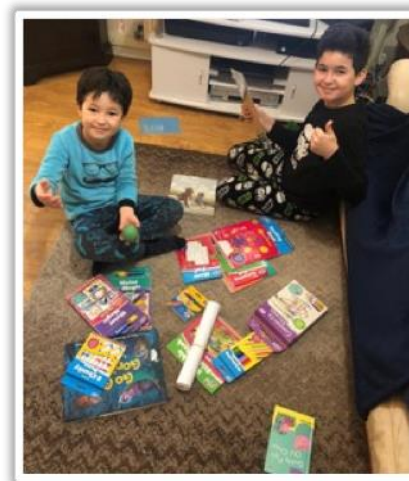
A Burngreave family enjoying the activities

“A big thank you for your special gift. God bless you more and more, my children say a big thank you”